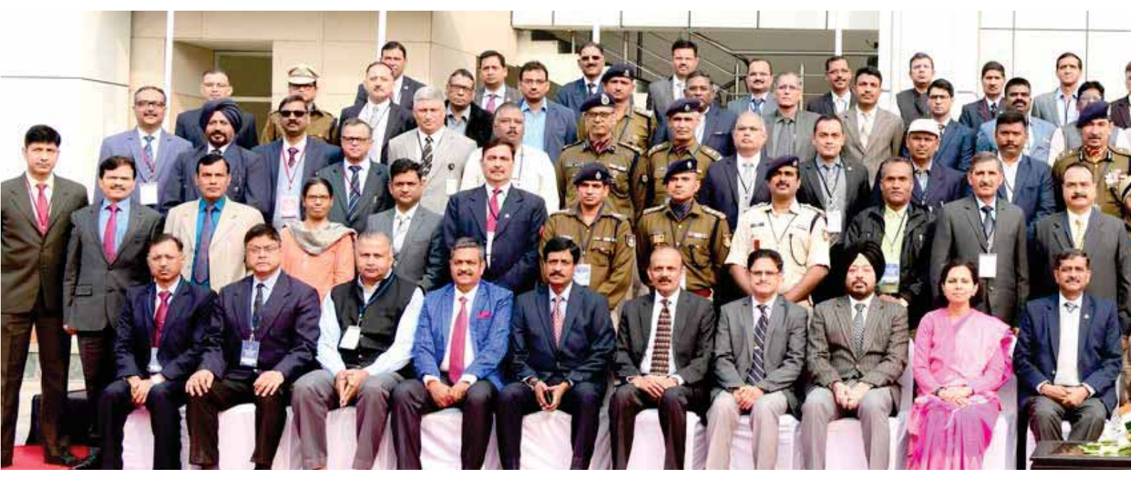
Smt. Archana Ramasundaram, IPS (Retd.), Hon'ble Member, Lokpal, Chief Guest, DG BPR&D, BPR&D Officers, and delegates of

The 37th National Training Symposium of Heads of Police Training Institutions was held on 12-13 December, 2019 at BPR&D Hqrs. The theme of the symposium was "Optimum Utilization of Resources Through Sharing and Networking". The symposium was attended by 130 senior police officers from States/ UTs and CAPFs/CPOs.