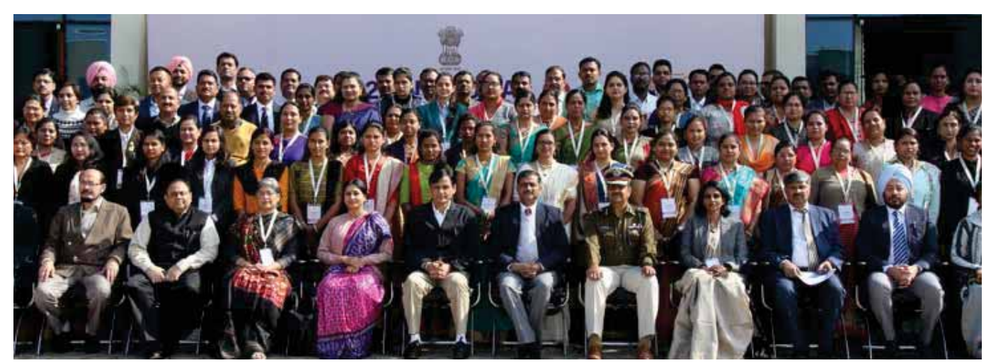
Shri Nityanand Rai, Hon'ble Minister of State for Home GOI, DG, BPR&D and other delegates at the 2<sup>nd</sup> National Conference on 'Uniformed Women in Prison Administration' at CAPT, Bhopal.