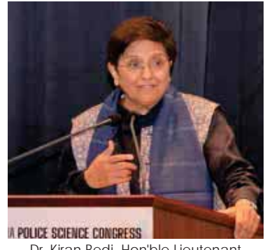
Dr. Kiran Bedi, Hon'ble Lieutenant Governor of Pudducherry, inaugurated the Conference.