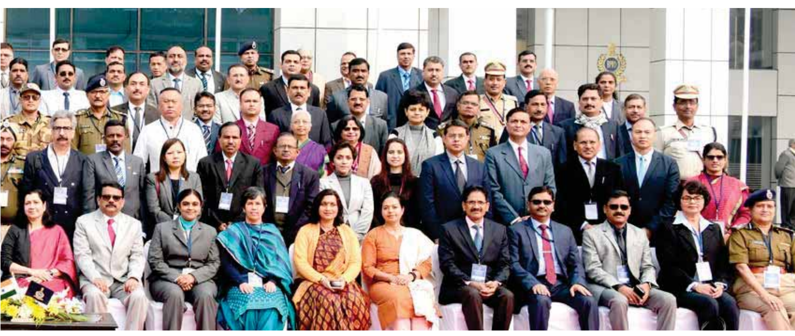
the 37th National Symposium of Heads of Police Training Institutions at the BPR&D Headquarters, New Delhi.