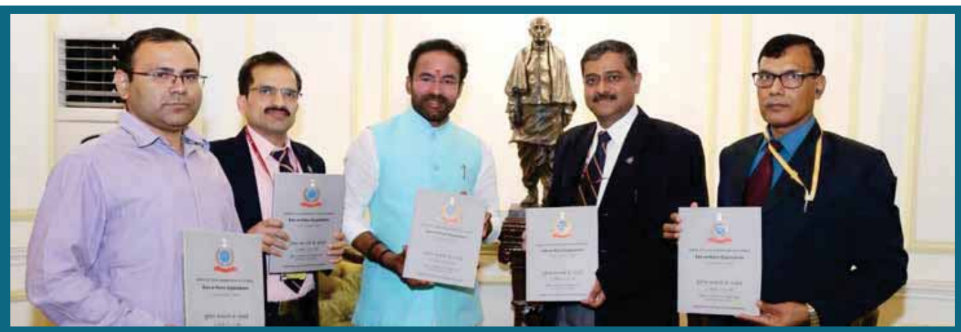
Shri. G. Kishan Reddy, Hon'ble Minister of State for Home Affairs along with DG, BPR&D and other officers releasing the publication "Data on Police Organisations"