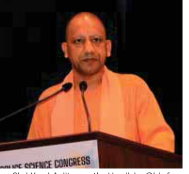
Shri Yogi Adityanath, Hon'ble Chief Minister, Uttar Pradesh addressing during Valedictory Session.