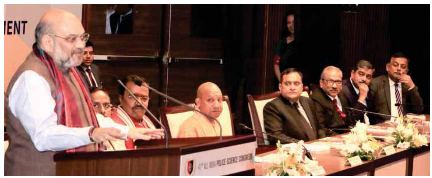
Shri Amit Shah, Shri Yogi Adityanath and other dignitaries at the Valedictory Session of the Congress.

of Pudducherry. Shri Amit Shah, Hon'ble Union Home Minister graced the Valedictory Session of the Congress as the Chief Guest, and was joined by Shri Yogi Adityanath, Hon'ble Chief Minister of Uttar Pradesh as the Guest of Honor. Both leaders also addressed the participants.